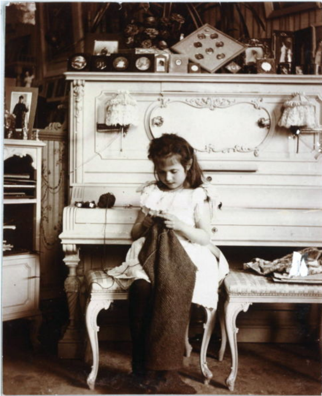
Grand Duchess Anastasia knitting in her mother's boudoir

http://en.wikipedia.org/wiki/Grand_Duchess_Anastasia_Nikolaevna_of_Russia