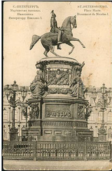
Monument to Nicholas I on St. Isaac's Square

Russia fought a successful war with the Ottomans in 1828 and 1829. In 1833 Russia negotiated the Treaty of Unkiar-Skelessi with the Ottoman Empire. The major European parties mistakenly believed that the treaty contained a secret clause granting Russia the right to send warships through the Bosporus and Dardanelles straits. By the London Straits Convention of 1841, they affirmed Ottoman control over the straits and forbade any power, including Russia, to send warships through the straits. Based on his role in suppressing the revolutions of 1848 and his mistaken belief that he had British diplomatic support, Nicholas moved against the Ottomans, who declared war on Russia in 1853.