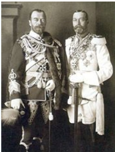
King George V (right, Queen Elizabeth's grandfather) with his first cousin Tsar Nicholas II, their mothers - Queen Alexandra of the United Kingdom and Empress Maria Feodorovna of Russia (Princess Dagmar of Denmark) - were sisters. Berlin, 1913