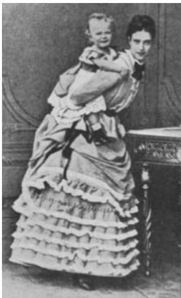
Nicholas II with his mother (1870).

Nicholas became Tsarevich following the assassination of his grandfather, Alexander II on 13 March 1881 and the subsequent accession of his father, Alexander III . Nicholas and other family members witnessed this event while staying at the Winter Palace in Saint Petersburg , but for security reasons, the new Tsar and his family relocated their primary residence to the Gatchina Palace outside the city.