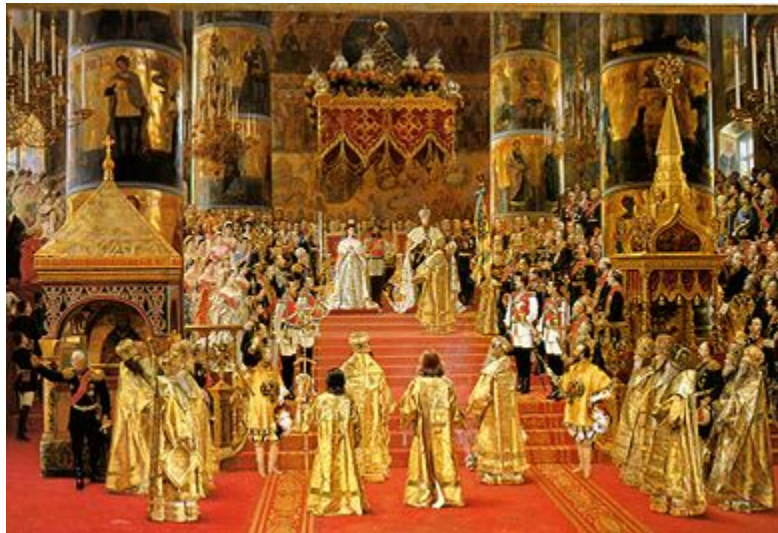
Portrait by the artist Georges Becker of the coronation of Tsar Alexander III and Empress Maria Fyodorovna , which took place on 28 May [ O.S. 15 May ] 1883 at the Uspensky Sobor Cathedral of the Moscow Kremlin . On the left of the dais can be seen his young son and heir, the Tsarevich Nicholas , and behind Nicholas can be seen a young Grand Duke George .

Alexander became heir apparent by the sudden death of his elder brother in 1865. It was then that he began to study the principles of law and administration under Konstantin Pobedonostsev , who was then a professor of civil law at Moscow State University and who later (in 1880) became chief procurator of the Holy Synod . Pobedonostsev awakened in his pupil very little love for abstract studies or prolonged intellectual exertion, but he influenced the character of Alexander's reign by instilling into the young man's mind the belief that zeal for Russian Orthodox thought was an essential factor of Russian patriotism and that this was to be specially cultivated by every right-minded Tsar.