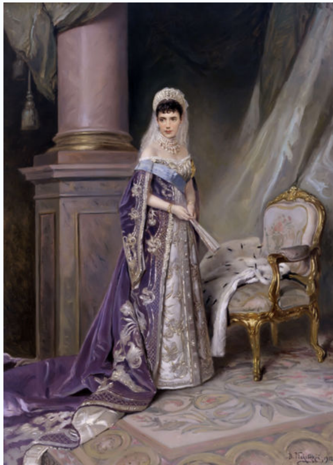
Portrait of Empress Maria Feodorovna. Gatchina Palace , 1885

Maria Feodorovna , born Princess Dagmar of Denmark (26 November 1847 - 13 October 1928) was Empress consort of Russia . She was the second daughter of Christian IX of Denmark and Louise of Hesse-Kassel . After her marriage to Alexander III of Russia , she became the Empress Consort of Russia as Maria Feodorovna . Among her children was the last Russian monarch, the Emperor Nicholas II , whom she outlived by ten years.