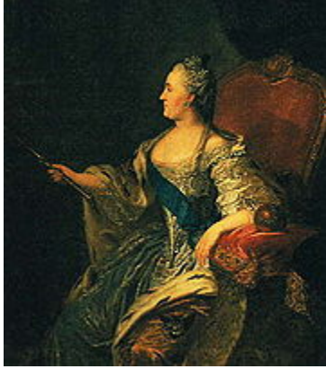
Catherine II of Russia

Portrait of Catherine in an advanced age, with the Chesme Column in the background.